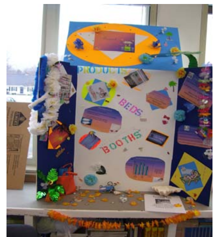
Example of student business plan presentation board

Congratulations to our seniors for their excellent participation in one of the Business Plan Expos that happened during the month of February. The English Department Senior Project focuses on students developing a business plan for a company they design. Students must present the plan using a web page, Power Point presentation and a three-fold presentation board at trade shows that are open to students, staff, School Committee members, Advisory Board members, and parents. The Senior Class really exemplified what SSVT represents in terms of solid work ethic, technological innovation, and finely tuned communication skills. A job well done!